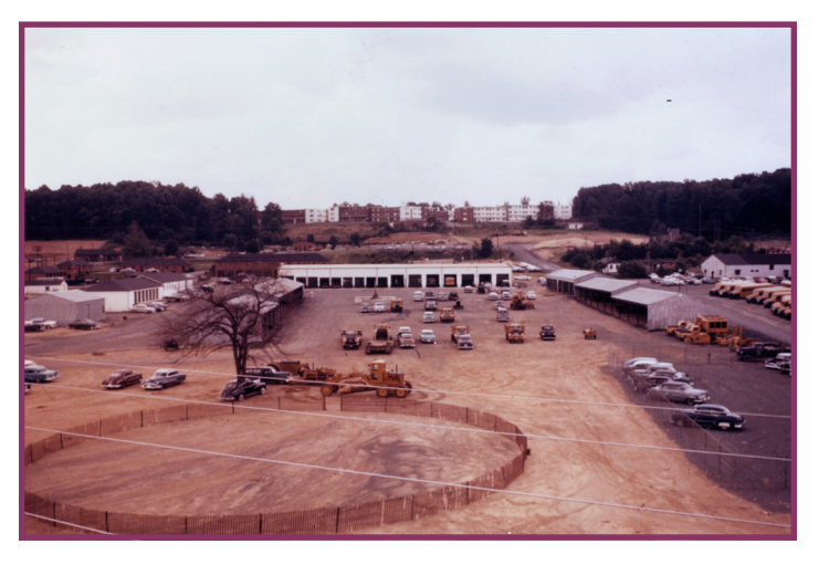
above: The Arlington Trades Center in the

The allocation of space at Trades has evolved through the years on an as-needed basis. Siting of operations and offices developed when space was abundant. Now, room for growth is limited and expansion is not an option given the developed surrounding area. Service levels have increased in size and complexity along with needs for vehicle, equipment and general storage. This has forced trade-offs in efficiency to maintain a safe work environment.